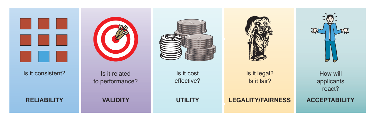
Figure 6.2 What Makes a Selection Method Good?

An assessment of the degree to which a selection method yields consistent results.